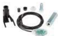
Encoder unit for 770N