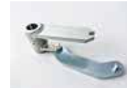
Opening to 140° kit