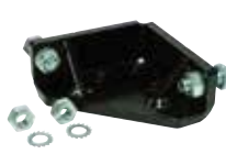
Internal closing mechanical stop