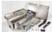
Stainless steel foundation box with release system (Patented)