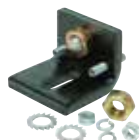
Internal opening mechanical stop