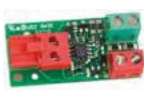
BUS XIB interface (for E045 or E024S control unit with non BUS photocell)