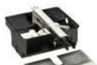
Foundation box with release system (Patented)