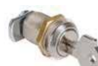
Release lock with customised key