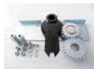
Opening to 180° kit